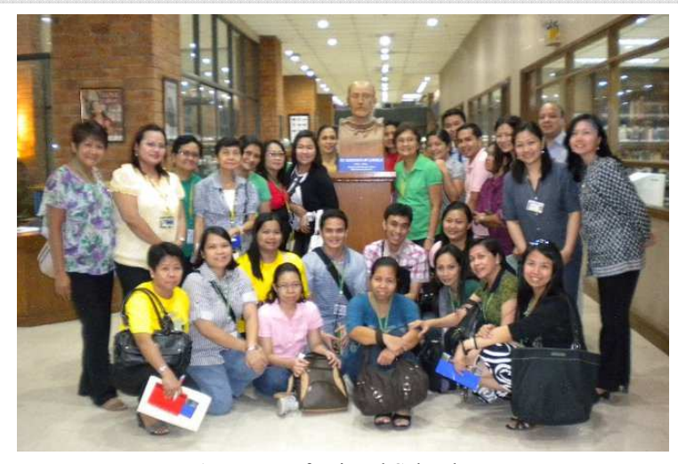
Ateneo Professional Schools

A total of 15 institutions were visited by ASLP during its "ASLP on the Go: Tour of Local and Foreign Cultural Center Libraries, Museums and Archives in Metro Manila," that happened last July 14-15, 2011.