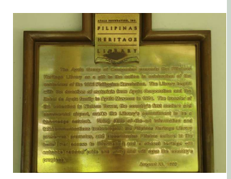
Filipinas Heritage Library