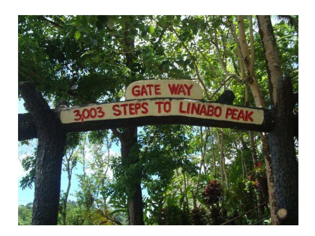
Linabo Peak, Zamboanga del Norte