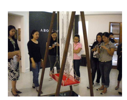
Lopez Library and Museum