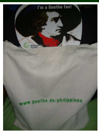
Freebies from Goethe-Institut Philippinen