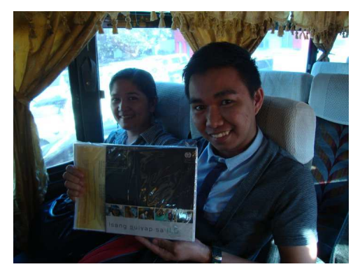
Participants show their free ILO materials

All the participants learned a lot from all the institutions we have explored in this two-day visit. An additional tour was done at the BSP money museum. There were many freebies given-away from ASLP, Instituto Cervantes, EFLC, TJIC, DLSU, ILO and GIP. EFLC treated the participants with a lunch, DLSU with doughnuts, GIP with coffee, Alliance with drinks and APS with snacks. The tour ended with a sumptuous dinner at Myrons located at Powerplant Mall in Rockwell.