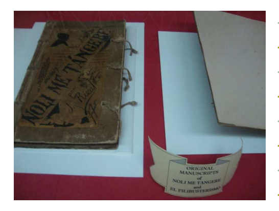
Rare books: National Library