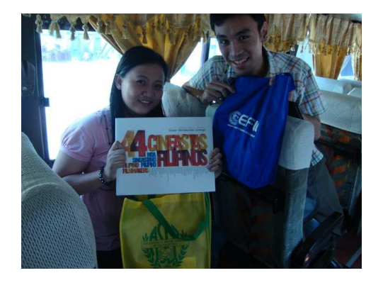
Participants get free bags from ASLP & EFLC and a Filipiniana book from Instituto Cervantes