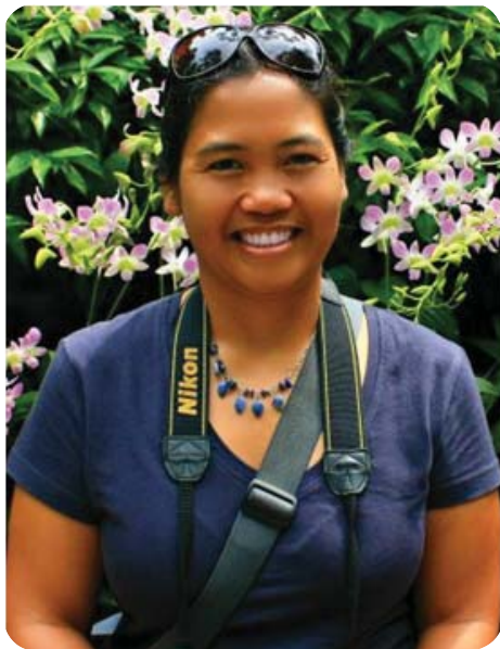
Taken in Singapore during her 2012 acquisitions trip