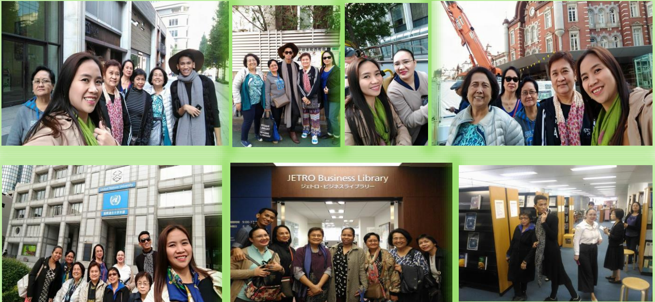
...Study Tour in Tokyo, Japan

THE OFFICIAL NEWSLETTER OF THE ASSOCIATION OF SPECIAL LIBRARIES IN THE PHILIPPINES