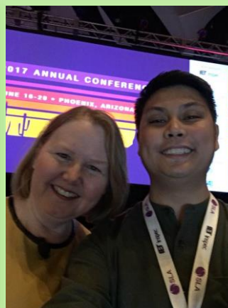
...ASLP President during the SLA annual conference